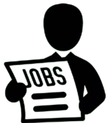
Economy and business impacts