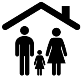
Social and household impacts