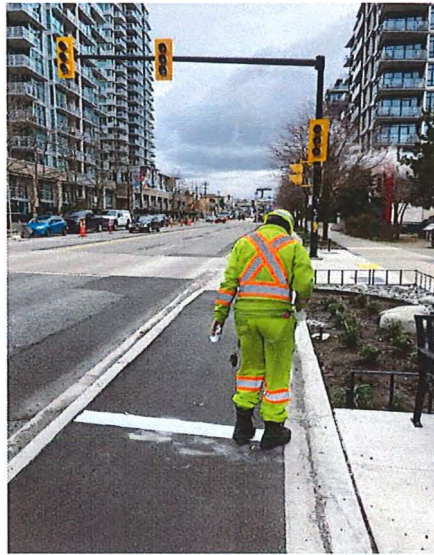
Temporary lines are painted in the mobility lane east of Lonsdale.