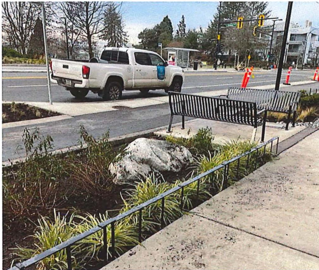
Street furnishings are installed throughout the corridor.