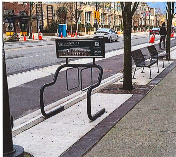
Bike racks are being newly installed or redeployed across the corridor.