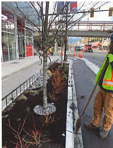
Drain rock is added to the landscape beds to support water filtration around trees.