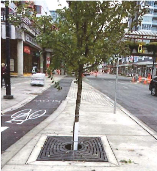
Trees installed near bus stops provide additional weather protection for transit customers.