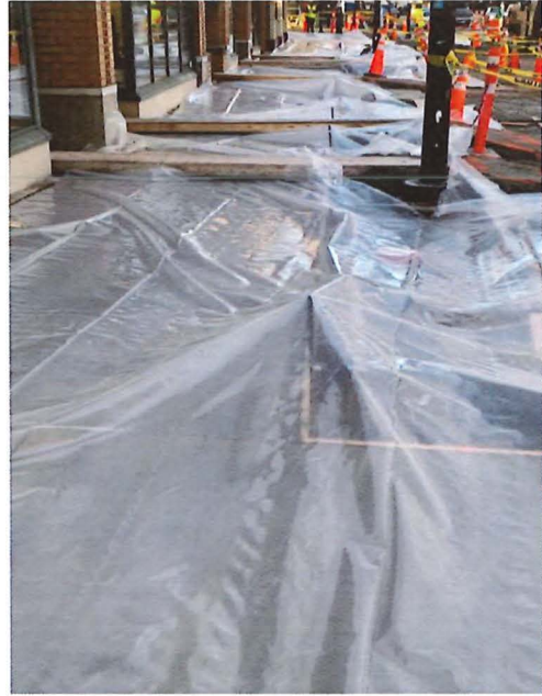
During the first 24 hour cure time, temporary bridges were placed to maintain business access. All businesses were consulted on the plan and timing of the works was scheduled to minimize impacts.