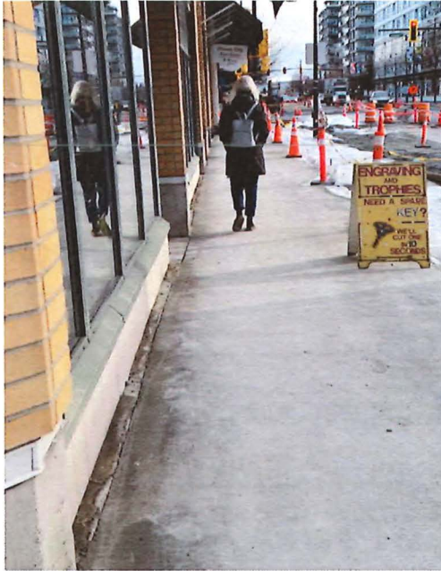
Fresh sidewalk poured on the 100 Block W. One week elapsed between removal of the sidewalk and completed construction of the replacement sidewalk.