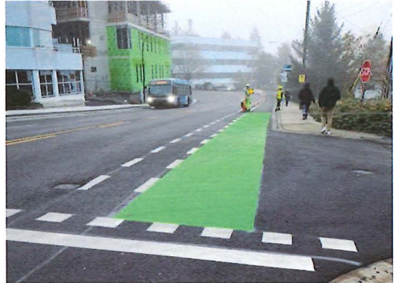
Green pavement markings are being placed on Forbes Avenue and Esplanade to increase visibility and awareness of street and driveway crossings for people driving and cycling.