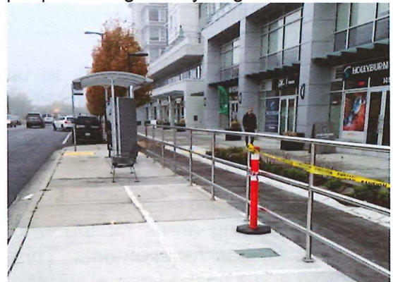
Railings are installed along the back of all floating bus stops to minimize potential conflicts between people using the transit stops and the mobility lanes.