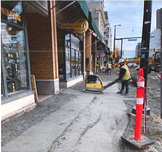
Sidewalk removal on the 100 Block W area was immediately compacted with accessibility ramping as required for all businesses.