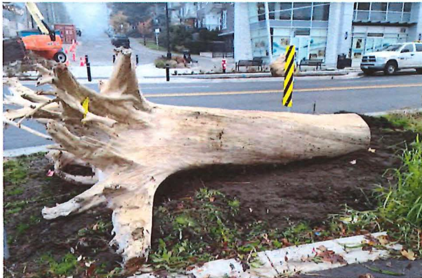
Driftwood is placed along the corridor as part of the “marine” elements within the landscaping theme for the street.