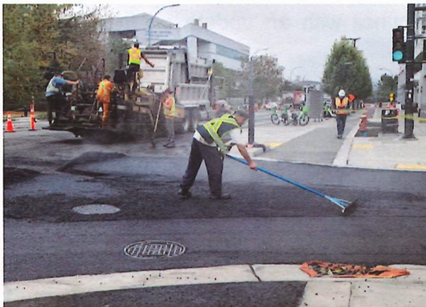
The paving process has involved base road repair work of utility trenches and other settled areas to maximise the lifespan of the new asphalt.