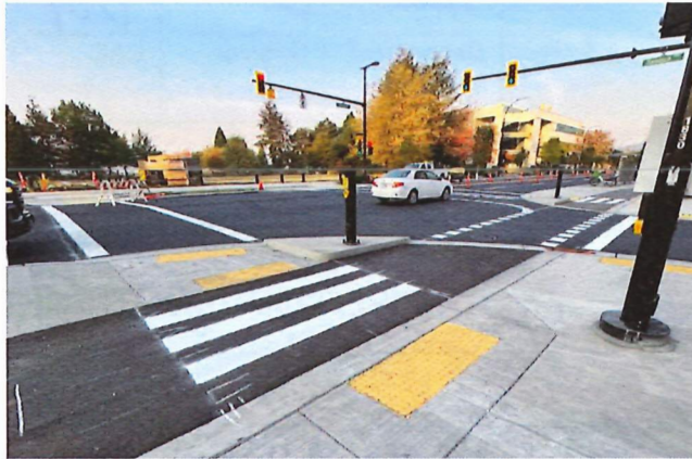
Line markings installed at Semisch. Zebra crossing gives priority to pedestrians when crossing mobility lane. Next, green paint to be added to raise awareness of mobility lane traveling through the intersection.