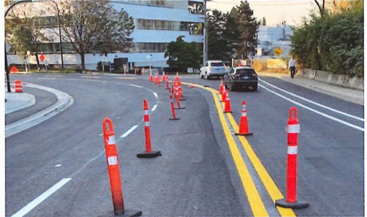
Line markings installed along Forbes. The on-street southbound mobility lane will have concrete barriers installed to provide separation and protection for mobility device users.