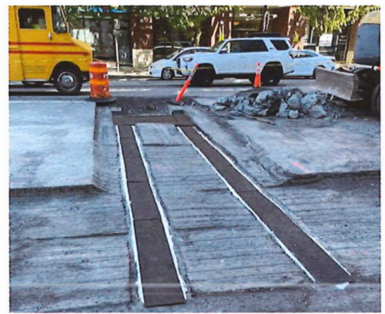
Final underground repair works have been completed with inspections underway.