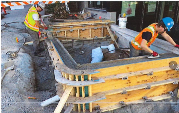
Wheelchair accessible terraced seating area begins to take shape near the TD Bank at Chesterfield.