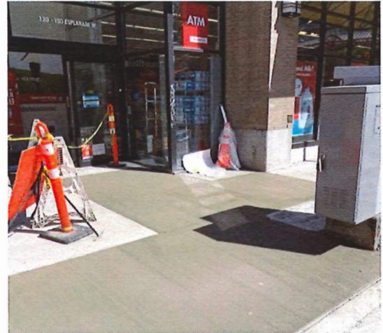
Entry ways are installed in segments to ensure business access is maintained while the concrete cures.