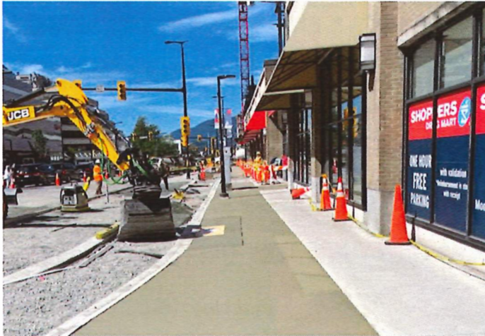
New sidewalk is installed between Chesterfield and Rogers outside Shoppers and IGA.

The final underground repair works on the 100 Block East Esplanade are nearing completion after a multi-stage process to complete the membrane resealing work. Complete street civil works have begun with removals and installation of irrigation upgrades for the trees.