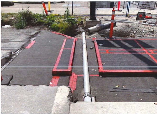
Completed membrane repair at midblock crossing between Lonsdale and St Georges.