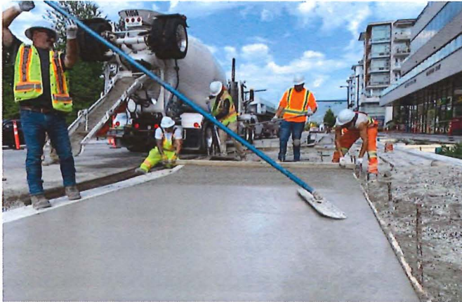
New sidewalk installation between Semisch and Chesterfield.

The final underground repair works on the 100 Block East Esplanade are nearing completion after a multi-stage process to complete the membrane resealing work. Core repairs east of the midblock and at the midblock have been completed. Final repairs at the concrete cuts near Lonsdale are underway. Complete street civil works have begun with milling works and irrigation installation and will continue on the south side as repair work is finalized and inspected.