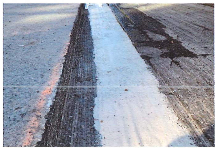
Completed concrete repairs and preliminary milling for core civil works east of Lonsdale.