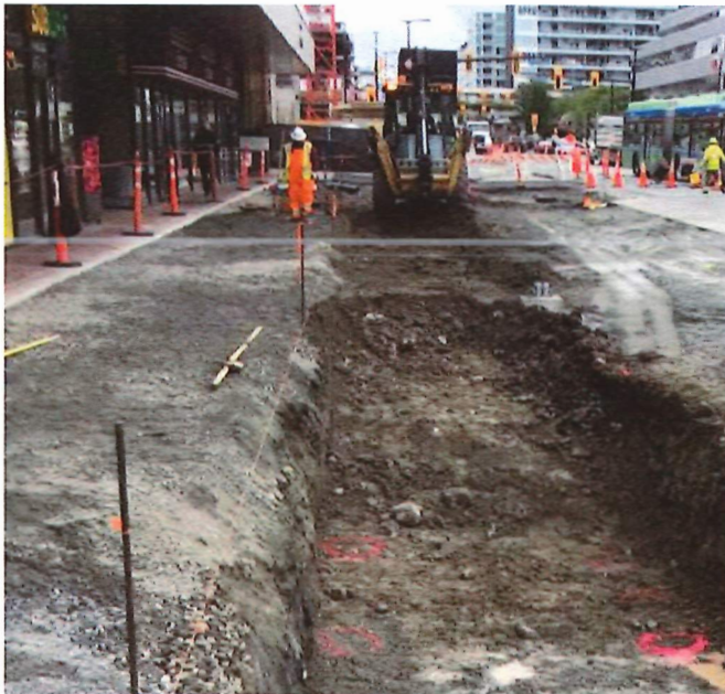
Excavating to install soil cells between Semisch and Chesterfield