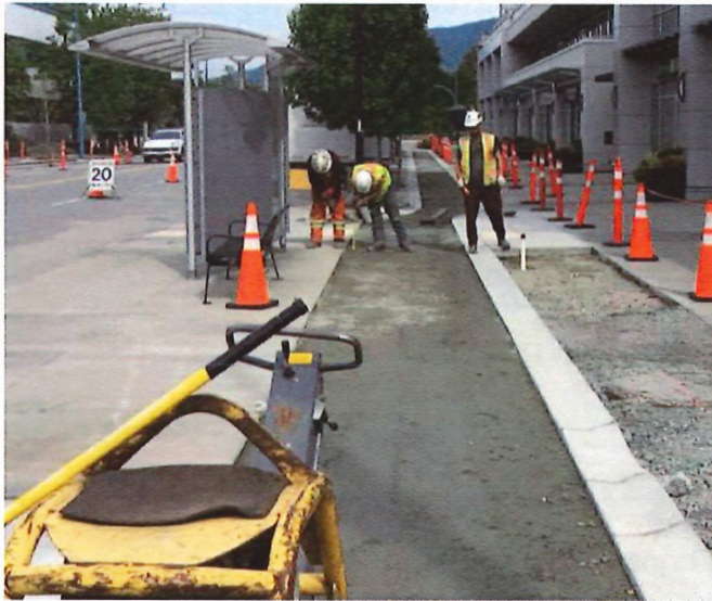
Retrofit bike lane curbs improve sidewalk accessibility from parking areas between Mahon and Semisch

block are necessary to facilitate works. In coordination with Coast Mountain Bus Company, notices are placed in advance of all stop closures to notify users of the temporary closure and providing direction to alternative stops. In recognition of the importance of transit for mobility, the reactivation of these stops are a priority for the project team.