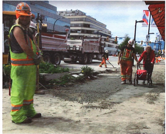
Site team assisting customers through the active work zone