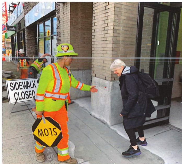
Site team assisting people around temporary detours on the sidewalk