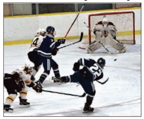
The North Van Wolf Pack battle the Grandview Steelers in a game during

The previous health order banning adults from playing meant that eight members of the Wolf Pack were not permitted to train with the team. They're back on the ice now, working out with teammates with the hope of some game play to finish the season. The team