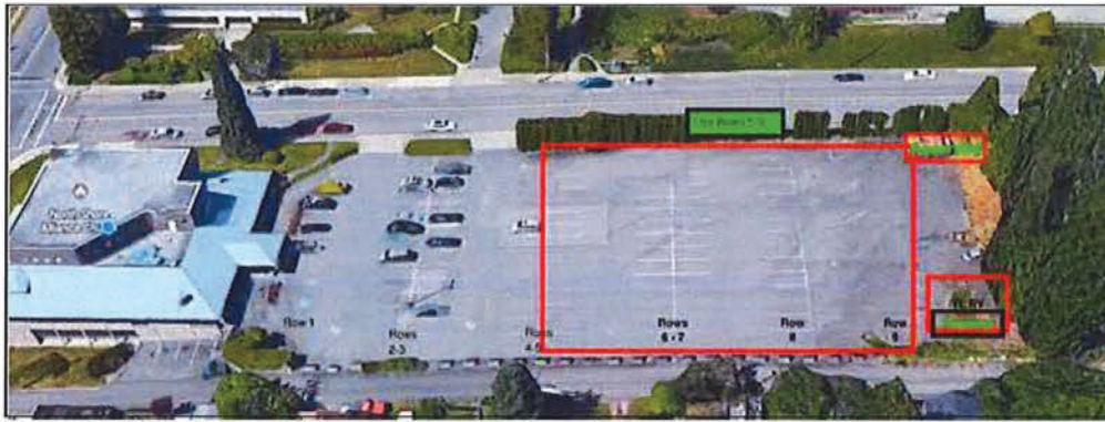
Community recreation centre parking available at North Shore Alliance Church

The New Harry Jerome Community Recreation Centre Project and Silver Harbour Seniors' Activity Centre (HJCRC/SH) continue to be the largest investment in community recreation in the City. When completed, it will provide more than 18,580 sq.m. of state of the art, inclusive and accessible community space to support our community's physical and social well-being. Bulk excavation of the site has been completed, marking a major project milestone. Construction continues and is focused on foundation works, pool plumbing and electrical works. Parking for patrons of the existing Harry Jerome Community Recreation Centre and Centennial Theatre is now available at the North Shore Alliance Church, accessed off 23rd Street east of St. Georges.