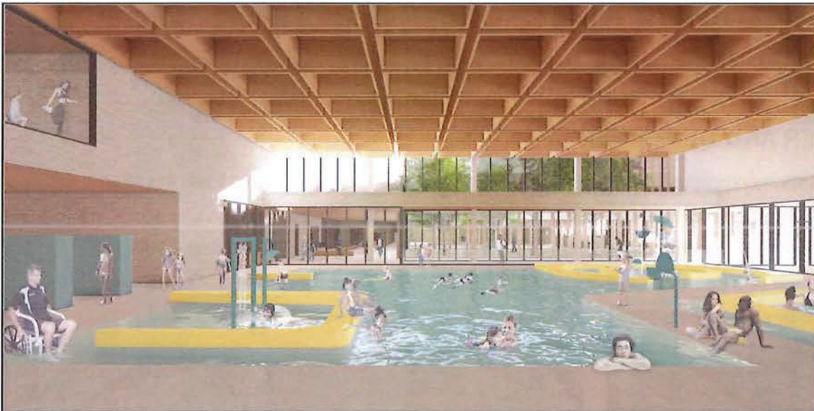
HJCRC Fully Accessible Aquatics Area

Did you know, almost 50% of adults in Canada experience a permanent or temporary physical disability or live with someone who has one? The new HJCRC and Silver Harbour Seniors' Activity Centre's design will ensure a high level of accessibility so every community member benefits. With the support of the City's Advisory Committee on Disability Issues (ACDI) and the partnership of the Rick Hansen Foundation, the HJCRC/SH project will meet the Foundation's Gold Certification Standard. For example, the aquatics area includes ramps into the lap and leisure pools and transfer ledges for the hot pools. In addition to addressing physical accessibility, the facilities will also feature audio and visual enhancements for people that require them.