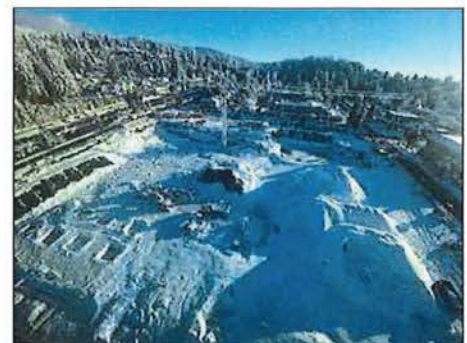
Foundation works December 2022