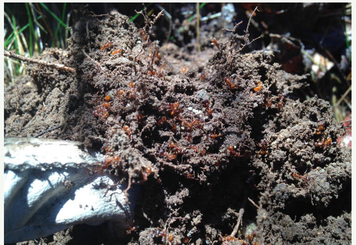
European fire ants in soil