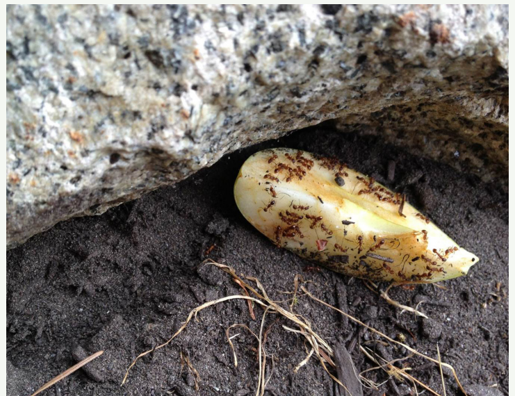
Experts often use a grid of apple slices to find the nests

For the complete set of best management practices for European fire ants, and other key invasive species, visit MetroVancouver.org and search 'Invasive Species'.