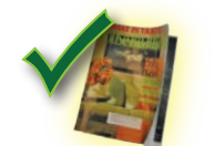
Magazines, catalogues, junk mail & glossy brochures