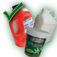
Hard plastic bottles & tubs with the codes 1 2 4 5 (e.g. milk jugs, shampoo bottles, yoghurt tubs, etc.)

Directions: Recycle only clean containers. Remove food residue, lids & caps. Flatten plastic bottles and nest smaller items inside larger items to save space. Soft plastic packaging & plastic bags are NOT accepted.