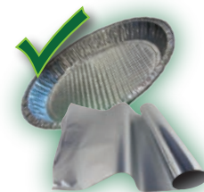
Clean Aluminum (e.g. rolled foil, pie plates & roasting pans)