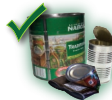
Cans - tin & aluminum