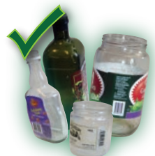
Clear & coloured glass bottles & jars