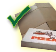
Flattened Cardboard (e.g. moving boxes, clean pizza boxes, etc.) Cut down to 2' x 2'