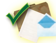
Paper (e.g. office, writing & computer)

Directions: Recycle only clean paper. Flatten all boxes to make more space. Staples & envelope windows are okay. NO tissue, box liners, food residue, etc.