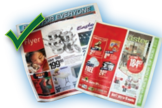
Newspaper Inserts (flyers)