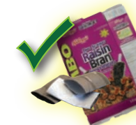
Boxboard (e.g. cereal, shoe, tissue or household product boxes)