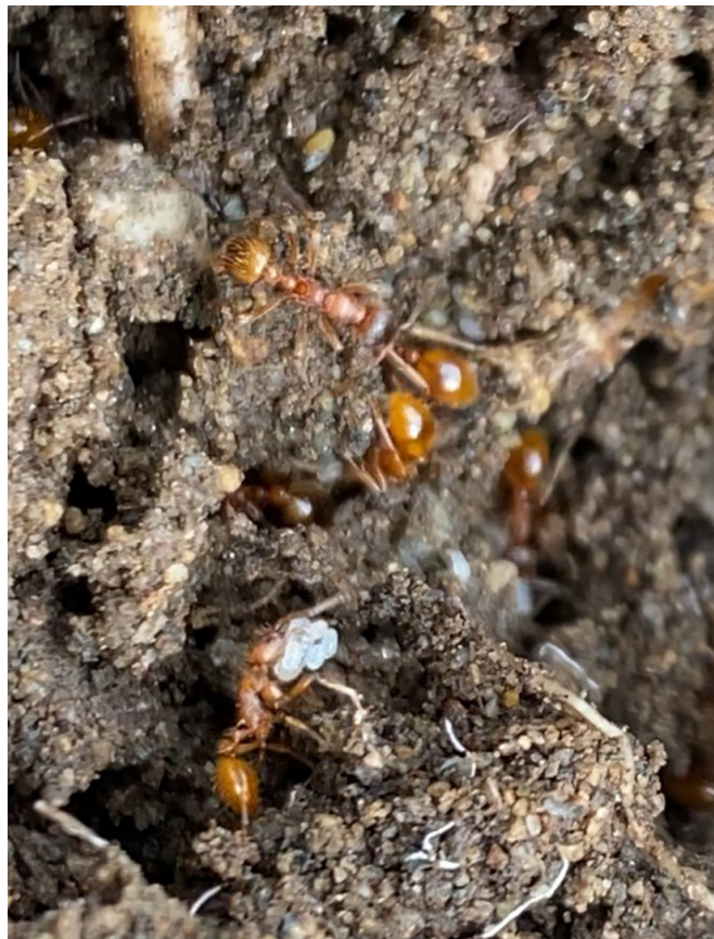
Worker ants moving eggs and larvae after nest disturbance

Reports submitted through these channels are reviewed by invasive species specialists who coordinate follow-up activities when necessary with the appropriate local authorities. However, some people may be hesitant to report European fire ant infestations as their presence may affect property values.