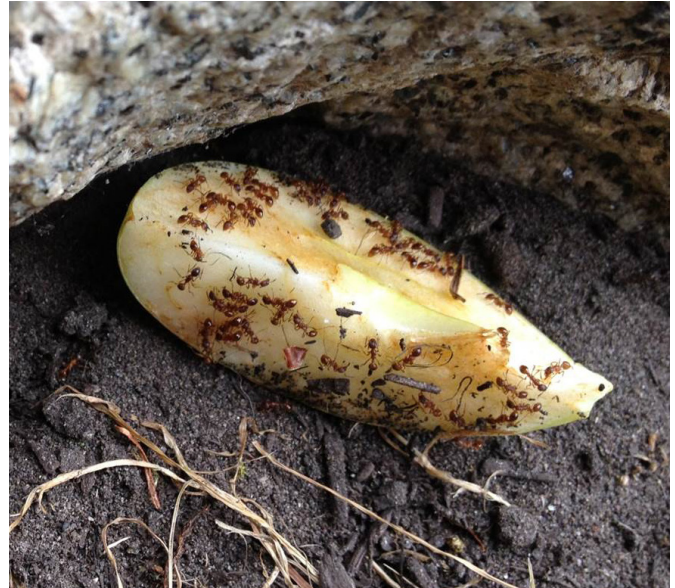
Use apple slices to locate the nest

Wire mesh or small inverted baskets (e.g., mesh fruit baskets) can be secured over the apple slices if removal of the bait by other animals (e.g., squirrels) is a concern.